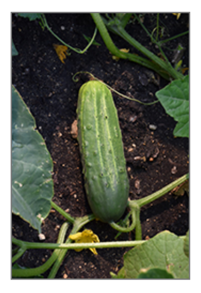
National Pickling Cucumber fruit

2974 Johnston St., Lafayette, LA 70503 (337) 264-1418 buyallseasons.com