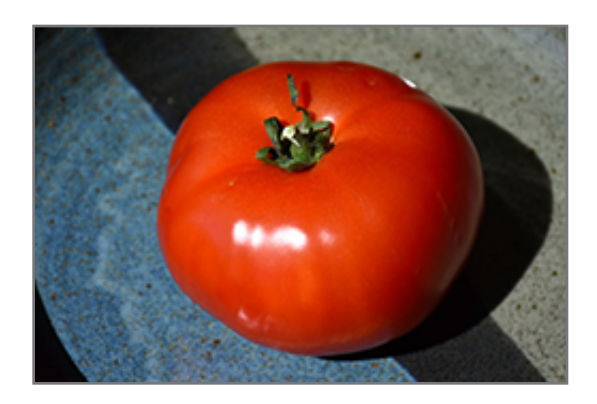
Bush Early Girl Tomato fruit

2974 Johnston St., Lafayette, LA 70503 (337) 264-1418 buyallseasons.com