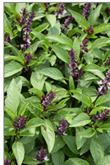
Sweet Basil flowers

Sweet Basil is a good choice for the edible garden, but it is also well-suited for use in outdoor pots and containers. It is often used as a 'filler' in the 'spiller-thriller-filler' container combination, providing the canvas against which the larger thriller plants stand out. Note that when growing plants in outdoor containers and baskets, they may require more frequent waterings than they would in the yard or garden.