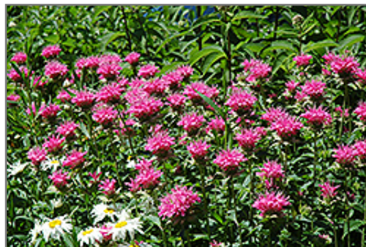
Marshall's Delight Beebalm flowers