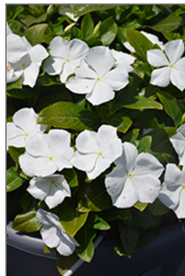
Cora XDR White flowers

Cora XDR White is recommended for the following landscape applications;