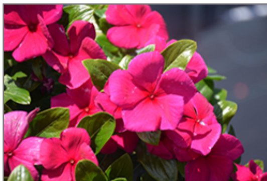
Cora XDR Hotgenta flowers

Cora XDR Hotgenta is recommended for the following landscape applications;