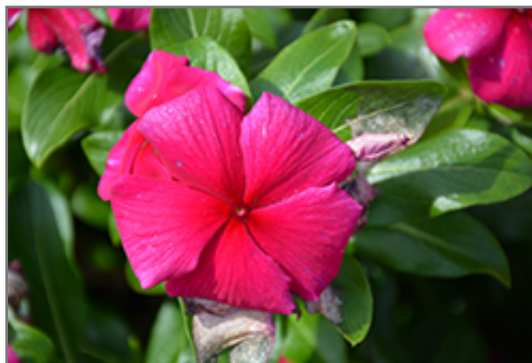
Cora XDR Hotgenta flowers