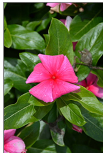
Cora XDR Deep Strawberry flowers

Cora XDR Deep Strawberry is recommended for the following landscape applications;