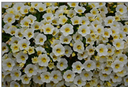
Lia White Calibrachoa flowers