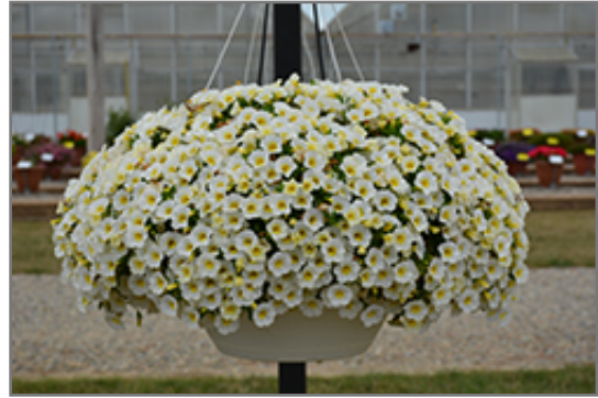
Lia White Calibrachoa in bloom