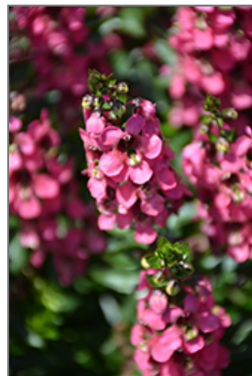
Serenita Rose Angelonia flowers

This plant will require occasional maintenance and upkeep, and should not require much pruning, except when necessary, such as to remove dieback. It is a good choice for attracting bees and butterflies to your yard, but is not particularly attractive to deer who tend to leave it alone in favor of tastier treats. It has no significant negative characteristics.