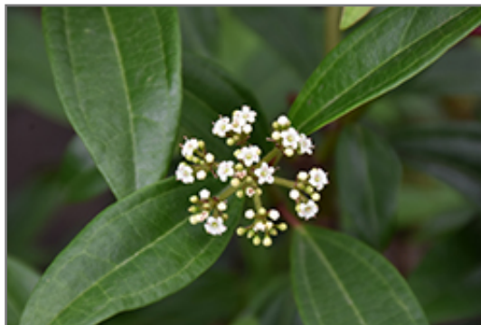
Moonlit Lace Viburnum flowers

This is a relatively low maintenance shrub, and should only be pruned after flowering to avoid removing any of the current season's flowers. Deer don't particularly care for this plant and will usually leave it alone in favor of tastier treats. It has no significant negative characteristics.