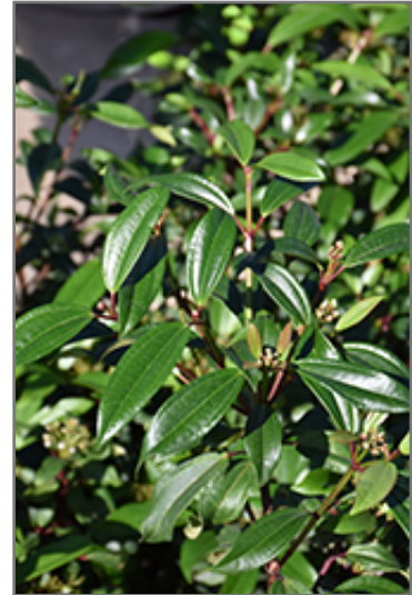
Moonlit Lace Viburnum foliage

This shrub does best in full sun to partial shade. It prefers to grow in average to moist conditions, and shouldn't be allowed to dry out. It may require supplemental watering during periods of drought or extended heat. It is not particular as to soil type or pH. It is highly tolerant of urban pollution and will even thrive in inner city environments. This particular variety is an interspecific hybrid.