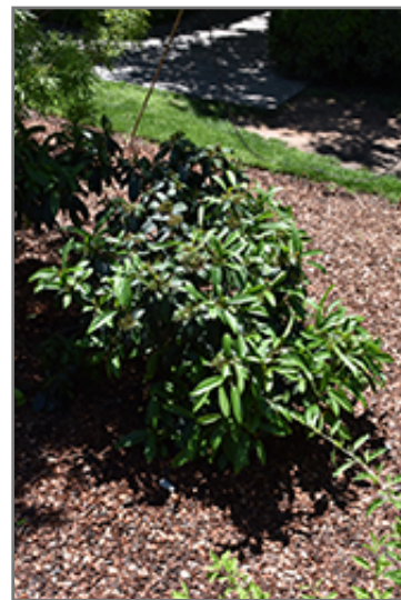
Moonlit Lace Viburnum