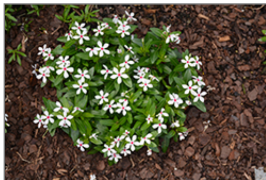
Soiree Kawaii White Peppermint Vinca in bloom