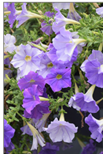
Supertunia Blue Skies Petunia flowers

Supertunia Blue Skies Petunia is recommended for the following landscape applications;