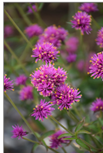
Truffula Pink Gomphrena flowers

This plant will require occasional maintenance and upkeep. Trim off the flower heads after they fade and die to encourage more blooms late into the season. It is a good choice for attracting bees and butterflies to your yard. It has no significant negative characteristics.