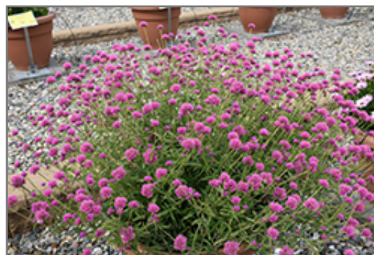
Truffula Pink Gomphrena in bloom