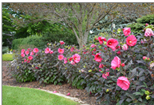
Summerific Evening Rose Hibiscus in bloom