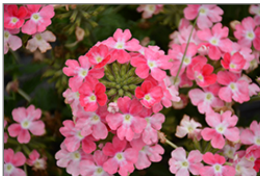
EnduraScape Pink Fizz Verbena flowers

EnduraScape Pink Fizz Verbena is recommended for the following landscape applications;