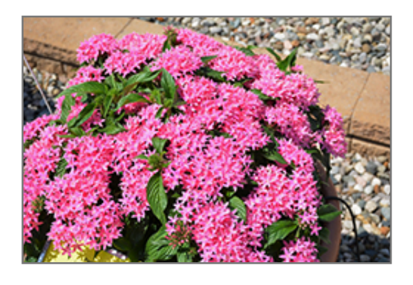
Lucky Star Pink Penta in bloom