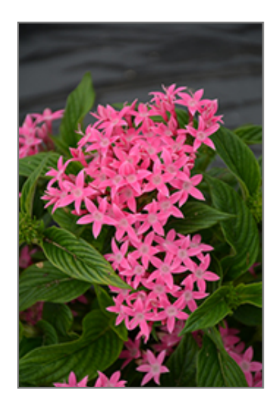
Lucky Star Pink Penta flowers