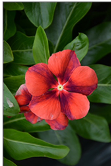
Tattoo Tangerine Vinca flowers

Tattoo Tangerine Vinca is a dense herbaceous evergreen perennial with a mounded form. Its medium texture blends into the garden, but can always be balanced by a couple of finer or coarser plants for an effective composition.