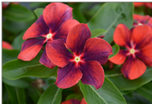
Tattoo Tangerine Vinca flowers