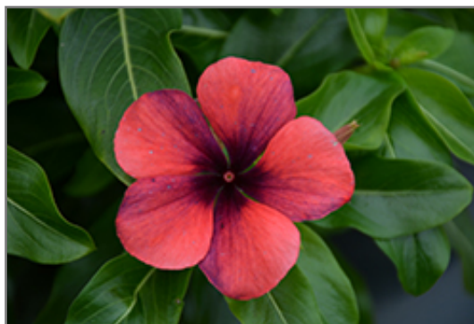
Tattoo Papaya Vinca flowers

Tattoo Papaya Vinca is recommended for the following landscape applications;