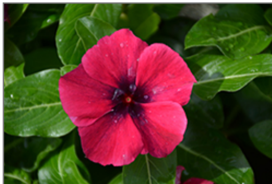
Tattoo Black Cherry Vinca flowers

Tattoo Black Cherry Vinca is a dense herbaceous evergreen perennial with a mounded form. Its medium texture blends into the garden, but can always be balanced by a couple of finer or coarser plants for an effective composition.