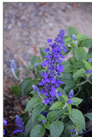
Mysty Salvia flowers