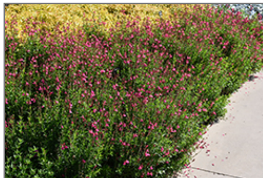
Pink Autumn Sage in bloom