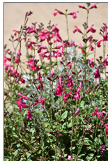
Mirage Hot Pink Autumn Sage flowers

Mirage Hot Pink Autumn Sage is a fine choice for the garden, but it is also a good selection for planting in outdoor pots and containers. It is often used as a 'filler' in the 'spiller-thriller-filler' container combination, providing a mass of flowers against which the larger thriller plants stand out. Note that when growing plants in outdoor containers and baskets, they may require more frequent waterings than they would in the yard or garden.