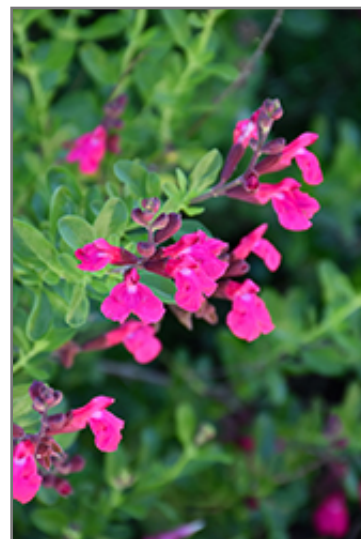
Mirage Hot Pink Autumn Sage flowers

Mirage Hot Pink Autumn Sage is an herbaceous evergreen perennial with an upright spreading habit of growth. Its medium texture blends into the garden, but can always be balanced by a couple of finer or coarser plants for an effective composition.