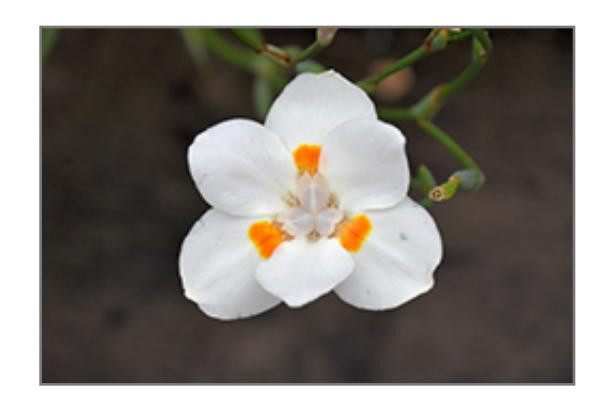
Orange Drop African Iris flowers