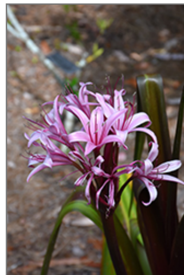
Sangria Crinum flowers