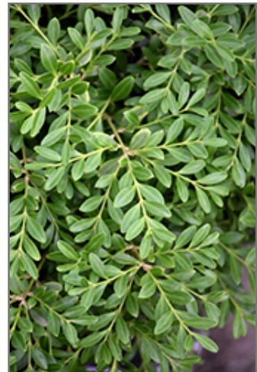
Green Borders Boxwood foliage