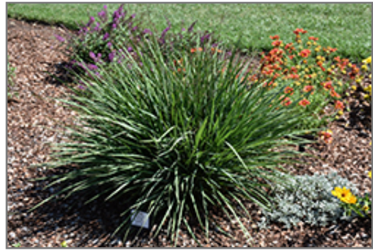
Coolvista Dianella

Coolvista Dianella will grow to be about 24 inches tall at maturity, with a spread of 24 inches. Its foliage tends to remain dense right to the ground, not requiring facer plants in front. It grows at a medium rate, and under ideal conditions can be expected to live for approximately 10 years. As an evergreen perennial, this plant will typically keep its form and foliage year-round.