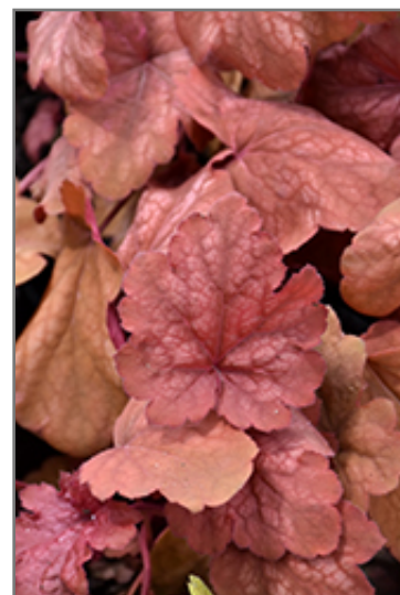
Heureka Amber Lady Bells foliage