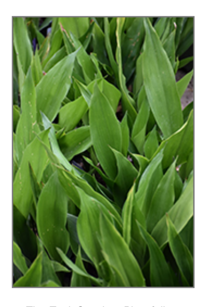
Tiny Tank Cast Iron Plant foliage

When grown indoors, Tiny Tank Cast Iron Plant can be expected to grow to be about 16 inches tall at maturity, with a spread of 24 inches. It grows at a medium rate, and under ideal conditions can be expected to live for approximately 10 years. This houseplant performs well in both bright or indirect sunlight and strong artificial light, and can therefore be situated in almost any well-lit room or location. It does best in average to evenly moist soil, but will not tolerate standing water. The surface of the soil shouldn't be allowed to dry out completely, and so you should expect to water this plant once and possibly even twice each week. Be aware that your particular watering schedule may vary depending on its location in the room, the pot size, plant size and other conditions; if in doubt, ask one of our experts in the store for advice. It is not particular as to soil type or pH; an average potting soil should work just fine.