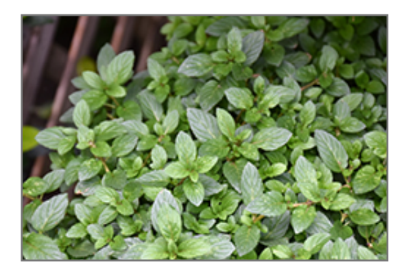
Peppermint foliage

Peppermint features bold spikes of lavender flowers with pink overtones rising above the foliage in mid summer. Its attractive fragrant pointy leaves remain green in color throughout the season.