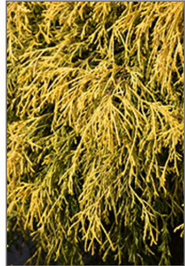
Paul's Gold Threadleaf Falsecypress foliage

Paul's Gold Threadleaf Falsecypress is recommended for the following landscape applications;