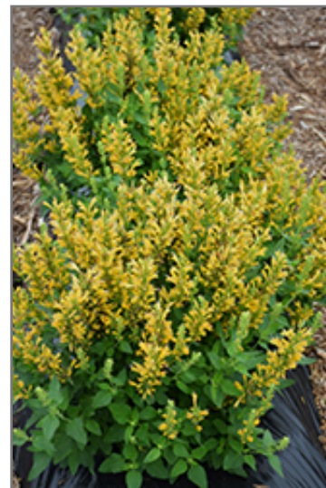
Dwarf Hummingbird Mint in bloom