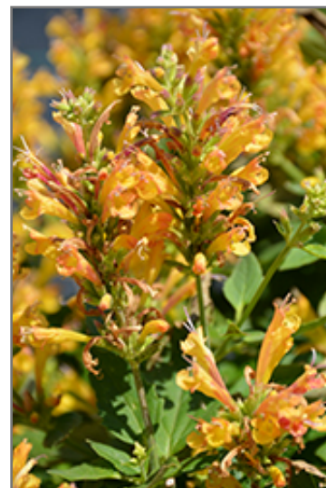
Dwarf Hummingbird Mint flowers

Dwarf Hummingbird Mint is recommended for the following landscape applications;