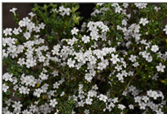
Variegated Serissa flowers

Variegated Serissa is recommended for the following landscape applications;