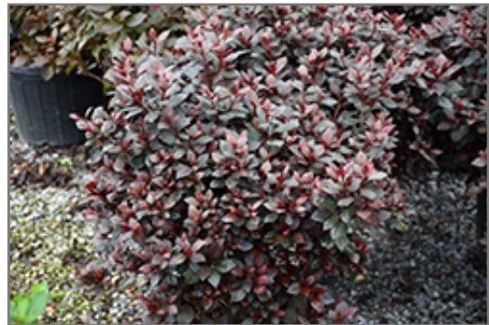
Crimson Majesty Azalea