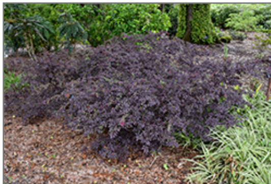
Purple Daydream Fringeflower