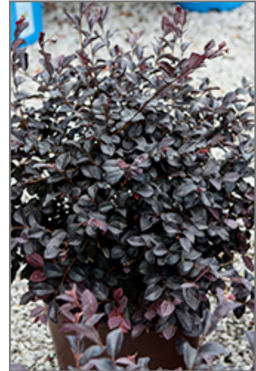
Cherry Blast Fringeflower

Cherry Blast Fringeflower makes a fine choice for the outdoor landscape, but it is also well-suited for use in outdoor pots and containers. Because of its height, it is often used as a 'thriller' in the 'spiller-thriller-filler' container combination; plant it near the center of the pot, surrounded by smaller plants and those that spill over the edges. It is even sizeable enough that it can be grown alone in a suitable container. Note that when grown in a container, it may not perform exactly as indicated on the tag - this is to be expected. Also note that when growing plants in outdoor containers and baskets, they may require more frequent waterings than they would in the yard or garden.