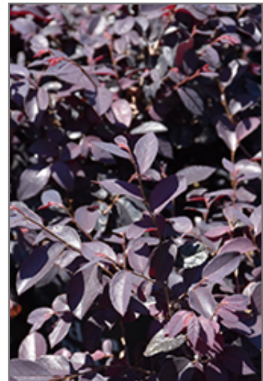
Cherry Blast Fringeflower foliage