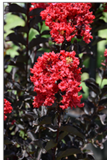
Ebony Fire Crapemyrtle flowers