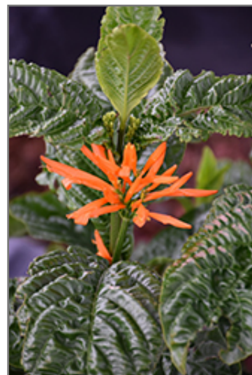
Orange Flame Justicia flowers