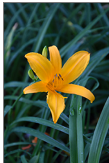
Aztec Gold Daylily flowers