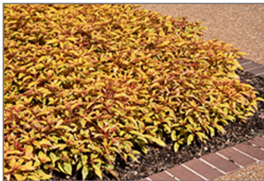
Lime Sizzler Firebush