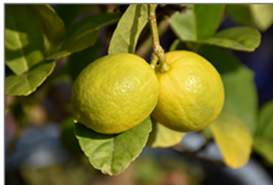
Key Lime fruit