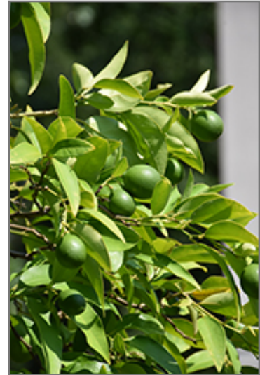
Key Lime fruit