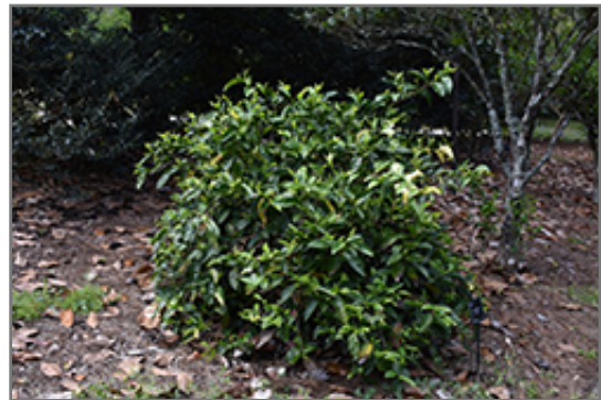
Yellow Tea Plant