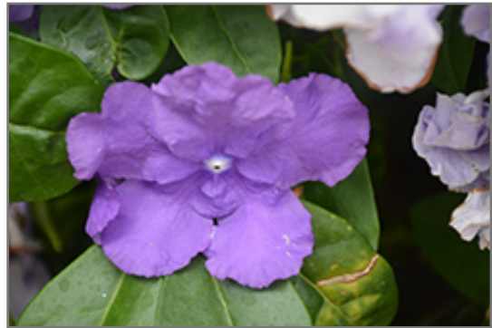
Yesterday Today And Tomorrow flowers

Yesterday Today And Tomorrow is recommended for the following landscape applications;