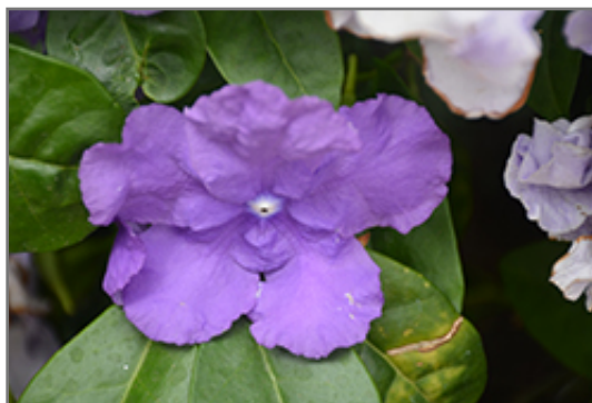
Yesterday Today And Tomorrow flowers

Yesterday Today And Tomorrow is recommended for the following landscape applications;