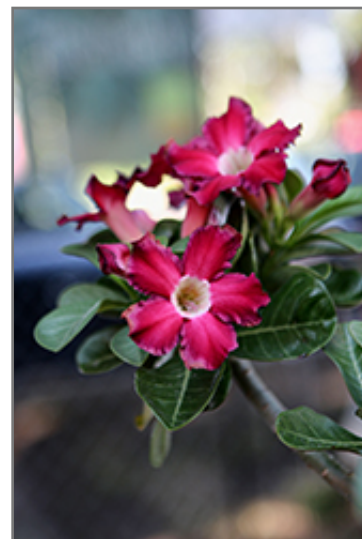
Desert Rose flowers