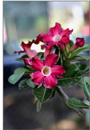
Desert Rose flowers