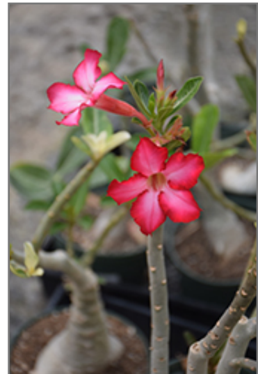
Desert Rose flowers