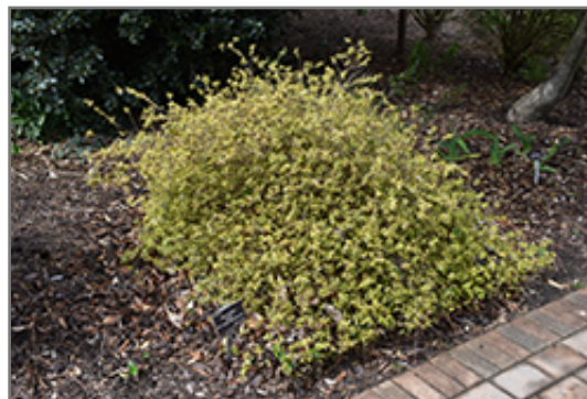
Twist of Orange Glossy Abelia