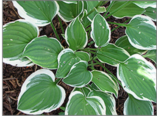
Diamond Tiara Hosta foliage

Diamond Tiara Hosta will grow to be about 12 inches tall at maturity extending to 18 inches tall with the flowers, with a spread of 24 inches. When grown in masses or used as a bedding plant, individual plants should be spaced approximately 20 inches apart. Its foliage tends to remain dense right to the ground, not requiring facer plants in front. It grows at a medium rate, and under ideal conditions can be expected to live for approximately 10 years. As an herbaceous perennial, this plant will usually die back to the crown each winter, and will regrow from the base each spring. Be careful not to disturb the crown in late winter when it may not be readily seen!