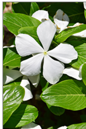
Mega Bloom White Vinca flowers

Mega Bloom White Vinca is recommended for the following landscape applications;