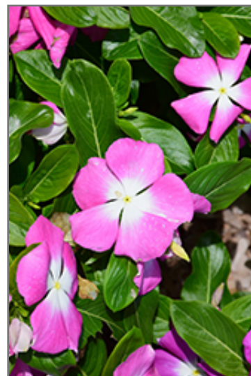
Mega Bloom Pink Halo Vinca flowers

Mega Bloom Pink Halo Vinca is recommended for the following landscape applications;