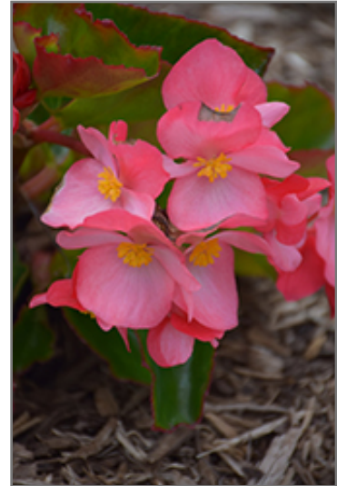
Megawatt Rose Green Leaf Begonia flowers

Megawatt Rose Green Leaf Begonia is an herbaceous evergreen perennial with an upright spreading habit of growth. Its medium texture blends into the garden, but can always be balanced by a couple of finer or coarser plants for an effective composition.