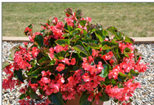
Megawatt Rose Green Leaf Begonia in bloom

Megawatt Rose Green Leaf Begonia is a fine choice for the garden, but it is also a good selection for planting in outdoor containers and hanging baskets. With its upright habit of growth, it is best suited for use as a 'thriller' in the 'spiller-thriller-filler' container combination; plant it near the center of the pot, surrounded by smaller plants and those that spill over the edges. It is even sizeable enough that it can be grown alone in a suitable container. Note that when growing plants in outdoor containers and baskets, they may require more frequent waterings than they would in the yard or garden.