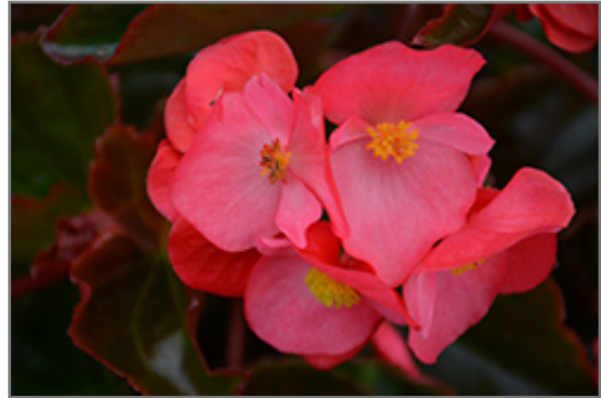
Megawatt Rose Bronze Leaf Begonia flowers

Megawatt Rose Bronze Leaf Begonia is an herbaceous evergreen perennial with an upright spreading habit of growth. Its medium texture blends into the garden, but can always be balanced by a couple of finer or coarser plants for an effective composition.