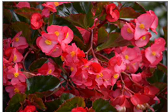
Megawatt Rose Bronze Leaf Begonia flowers