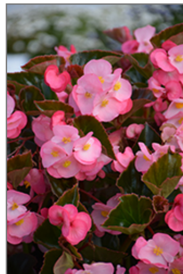
Megawatt Pink Bronze Leaf Begonia flowers

Megawatt Pink Bronze Leaf Begonia is an herbaceous evergreen perennial with an upright spreading habit of growth. Its medium texture blends into the garden, but can always be balanced by a couple of finer or coarser plants for an effective composition.