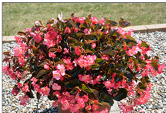
Megawatt Pink Bronze Leaf Begonia in bloom